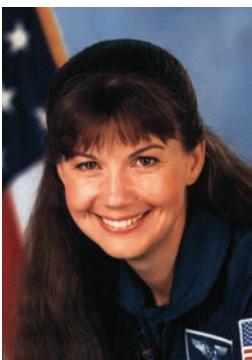
2004 John F. Kennedy Award Lt. Col. Catherine G. "Cady" Coleman