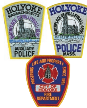
2008 Citizenship Award Holyoke Police, Auxiliary Police & Fire Departments.