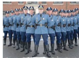
2012 Citizenship Award Massachusetts State Police Troop B